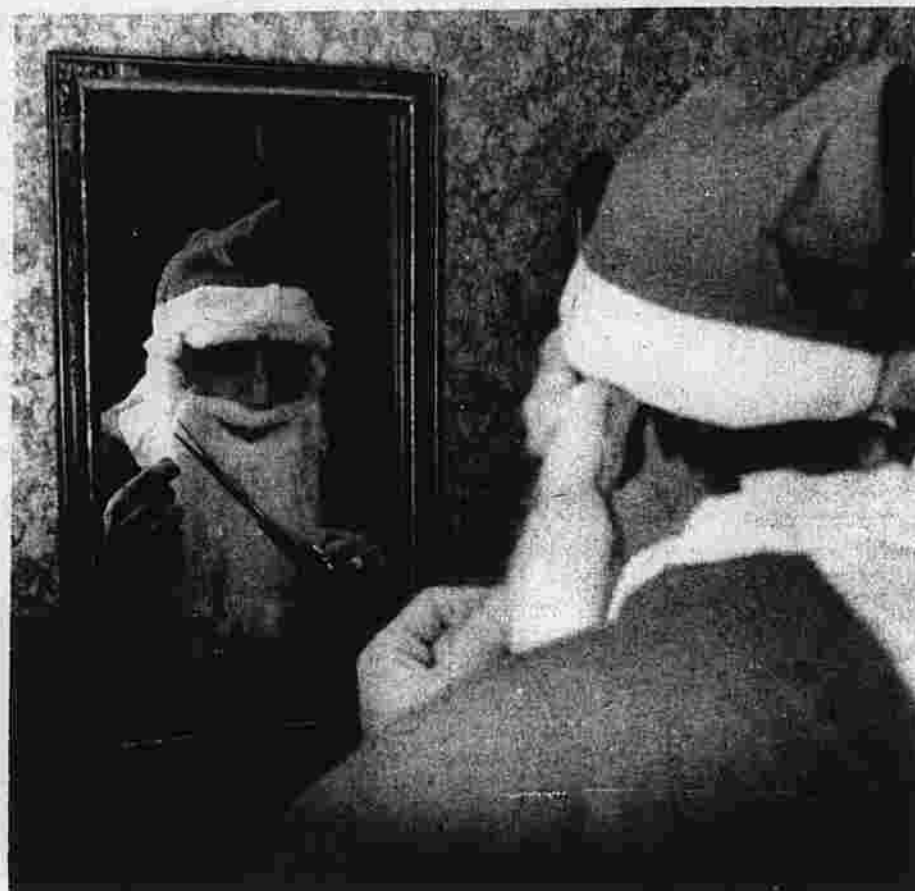
Santa trims his beard as he gets all spruced up to make his Christmas Eve journey.