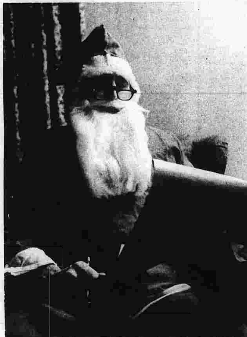
"He's making a list, and checking it twice, gonna find out who's naughty or nice....."