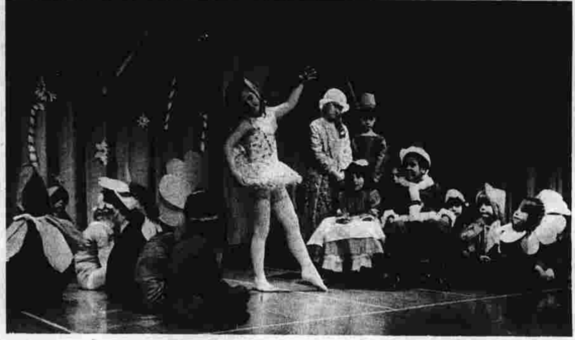
Ballet at Highland Park School