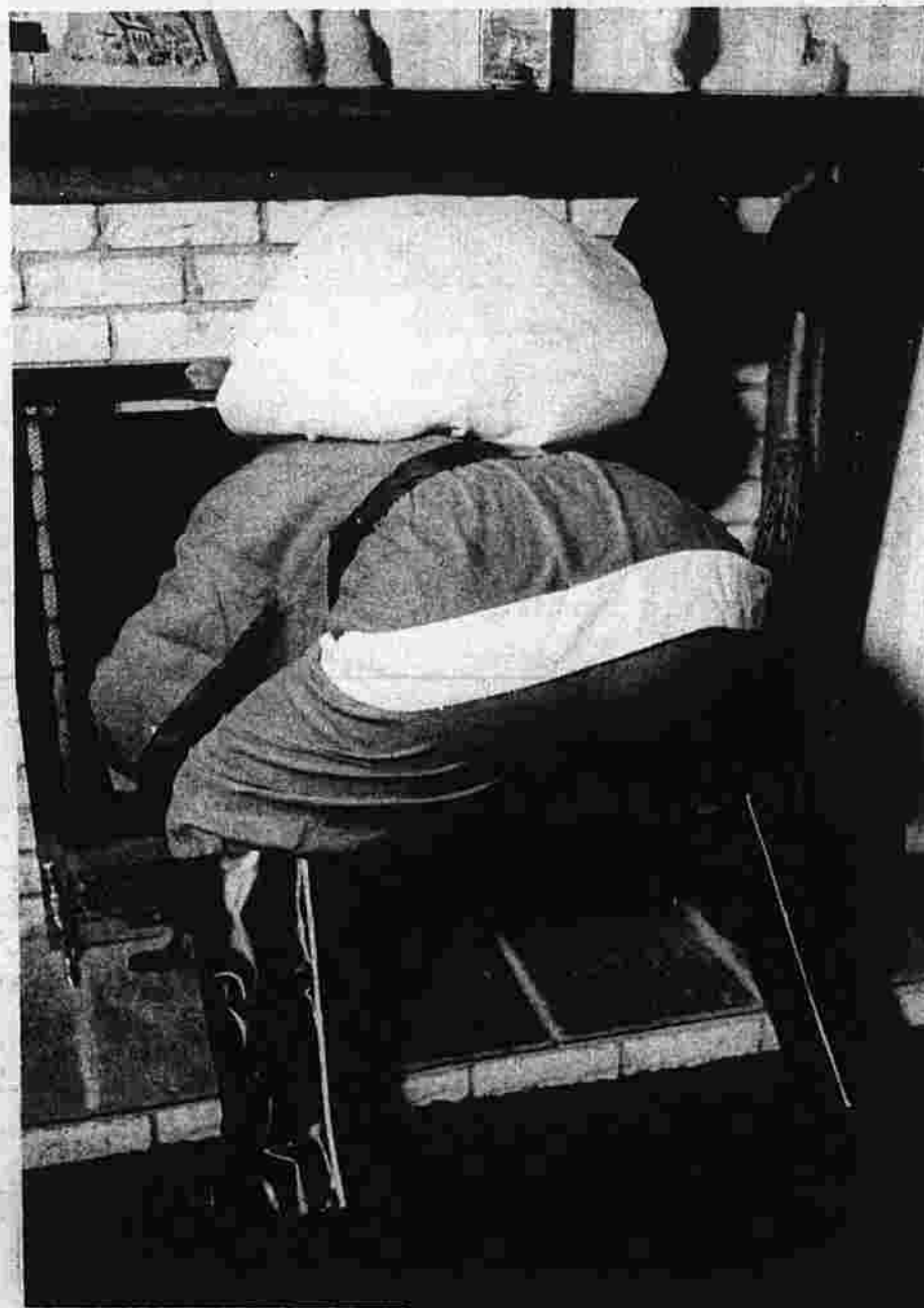
"Let's see now, I don't think I can get out this way," Santa says.